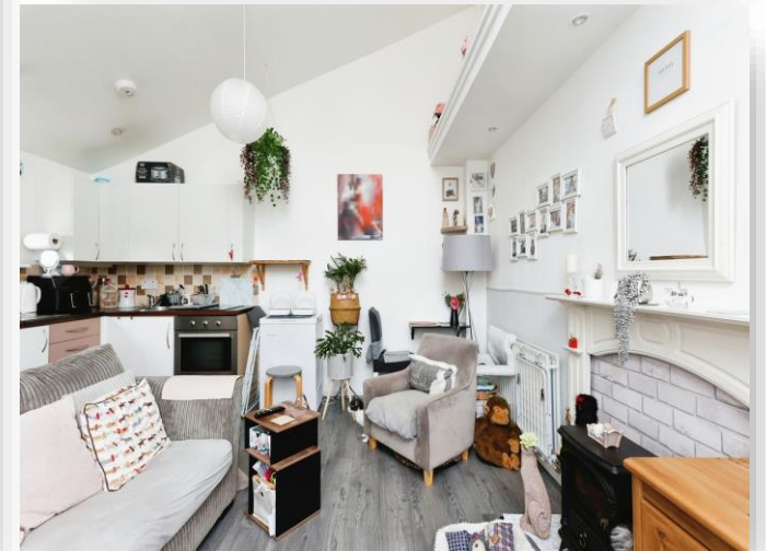
Yatesbury Avenue, Birmingham B35 6PU