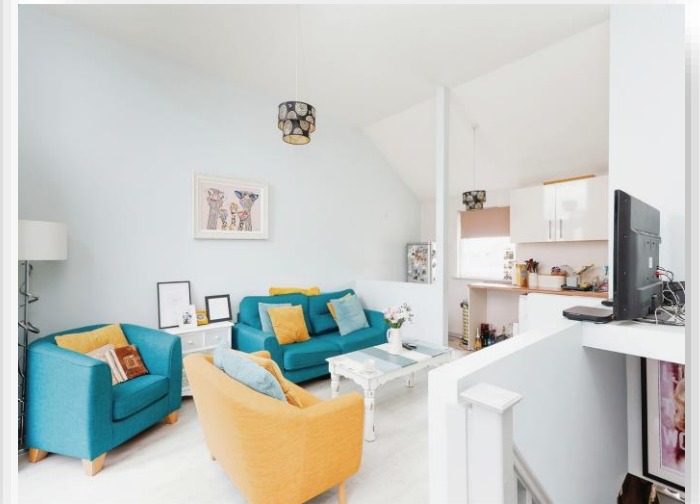
Merlin Way, Birmingham B35 6QN