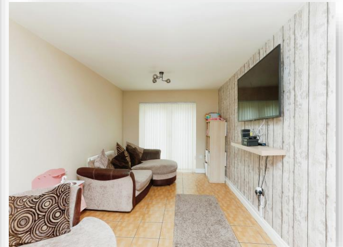
Papyrus Way, Birmingham B36 8RS