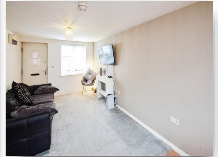
Yorkswood Road, Birmingham B34 7AU