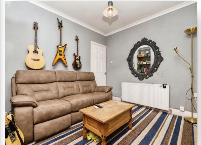
Julia Avenue, Birmingham B24 0QD