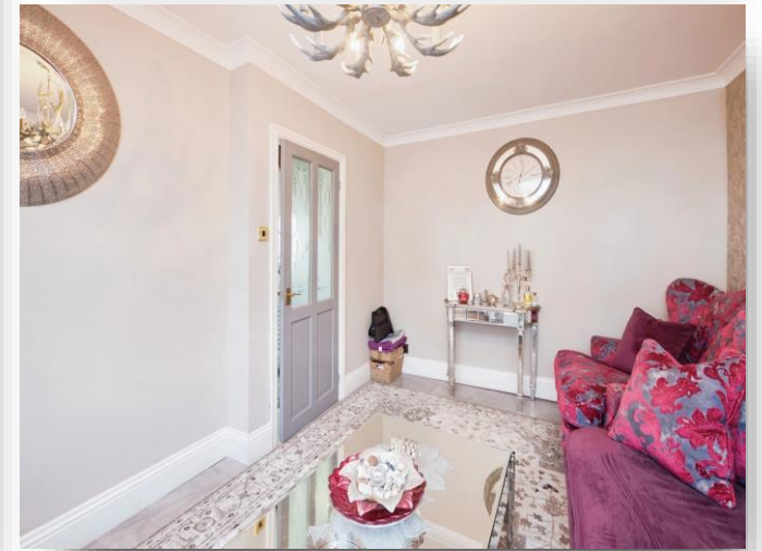
Old Bromford Lane, BIRMINGHAM B8 2RP