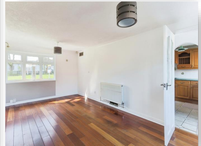
Camplea Croft, Birmingham B37 5DU