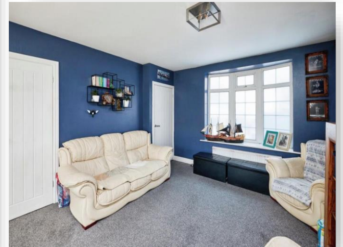
Yoxall Grove, Birmingham B33 9PX