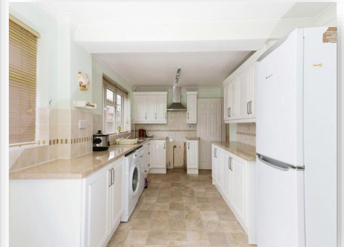
Castello Drive, Birmingham B36 9TB