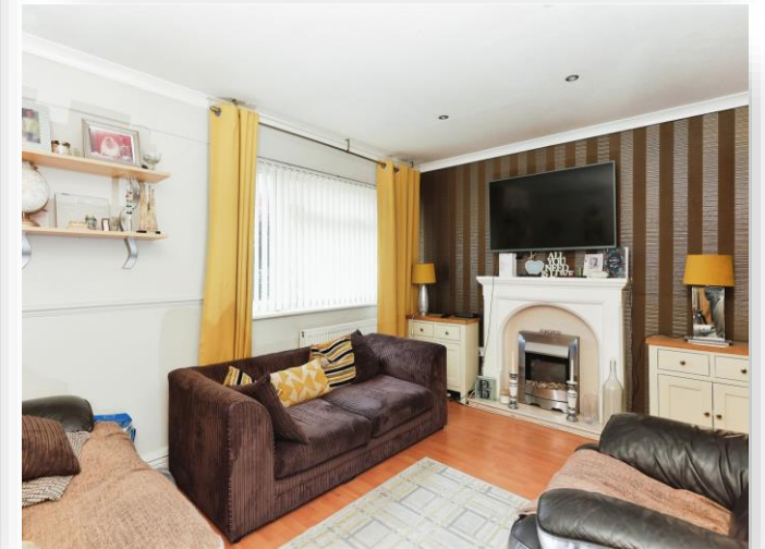
Starkey Croft, Birmingham B37 7SH