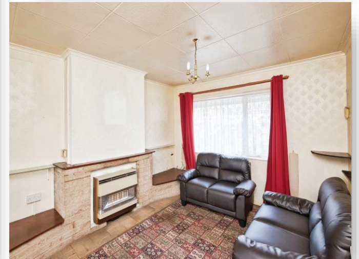
Longmeadow Crescent, Birmingham B34 7LB