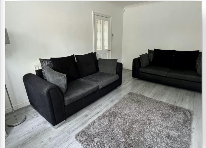
Kempson Road, Birmingham B36 8LR