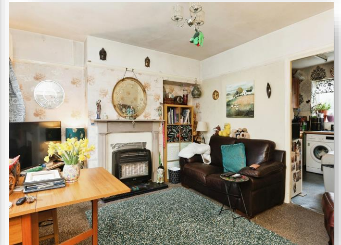
Swancote Road, Birmingham B33 9JE