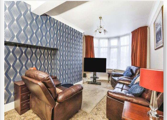
Water Orton Road, Birmingham B36 9HE