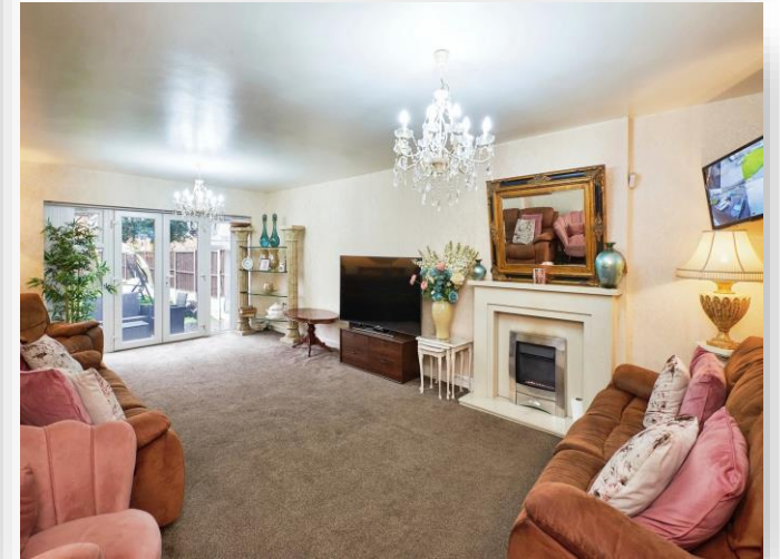
Madison Avenue, Birmingham B36 8EQ