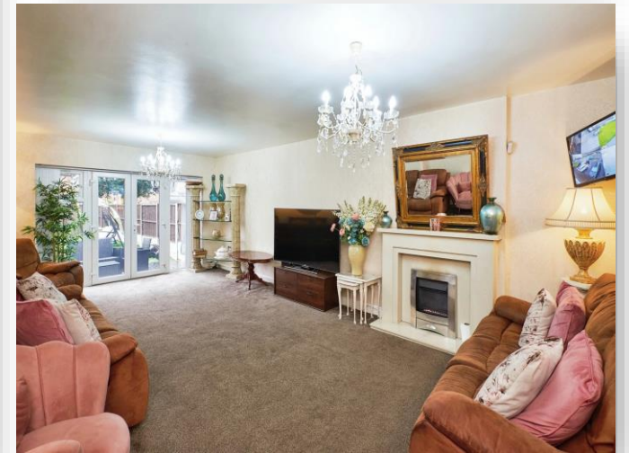
Madison Avenue, Birmingham B36 8EQ