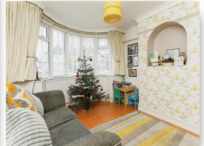
Brays Road, Birmingham B26 1NS