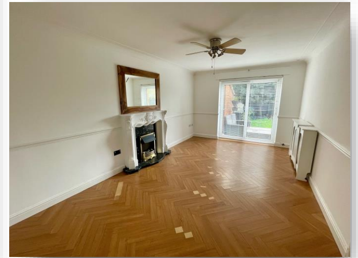
Camrose Croft, Buckland End Birmingham B34 6TP