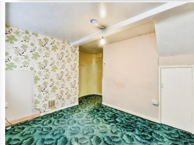
Trinity Street, Frome BA11 3DE