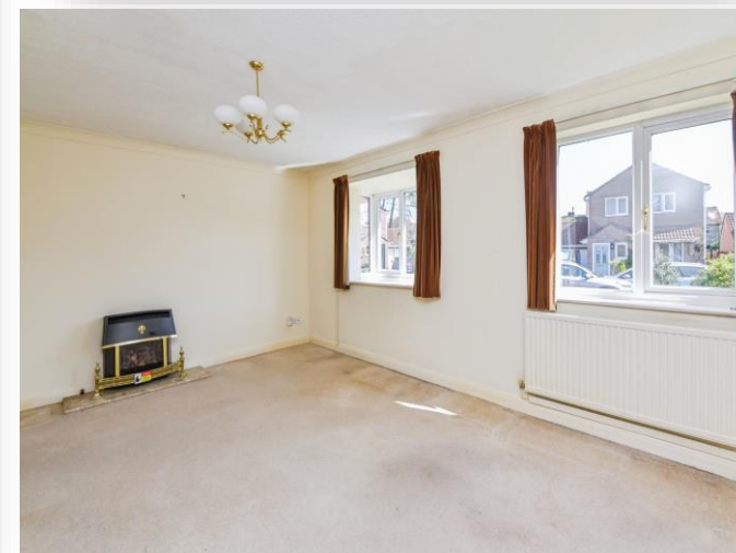
Vine Gardens, Frome BA11 2LX