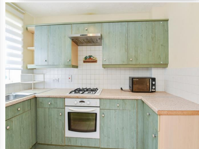
Rivers Reach, Frome BA11 1AQ