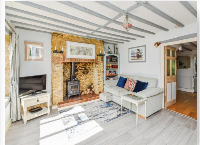
High Street, Wanstrow SHEPTON MALLET BA4 4TE