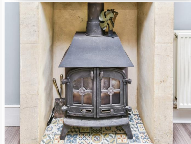
Belle Vue, Midsomer Norton Radstock BA3 2BS