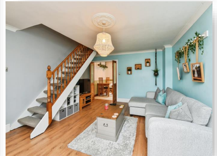
Mulberry Court, Frome BA11 2UF