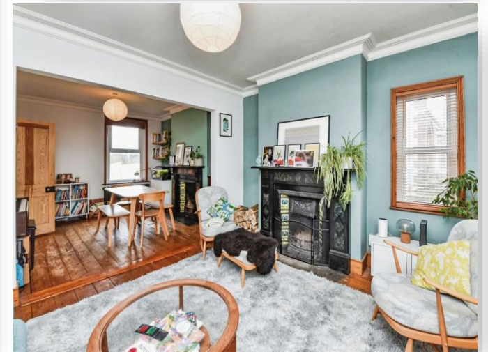
Rodden Road, Frome BA11 2AW