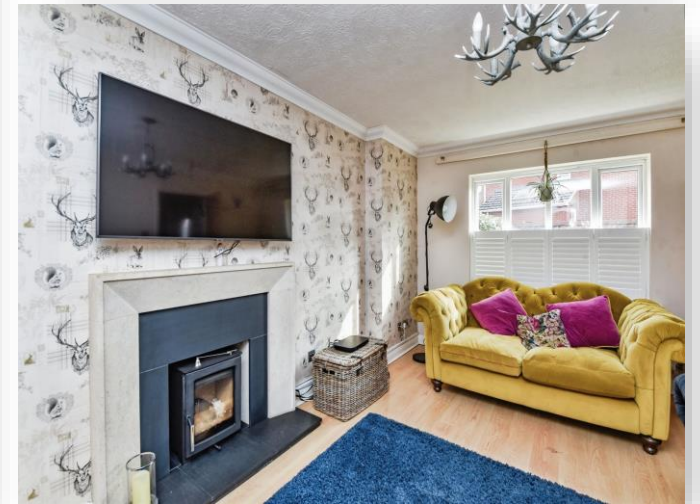
Foxcote Gardens, Frome BA11 2DS