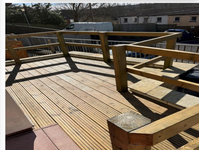
Leonards Barton, Frome BA11 2LS