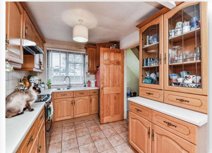
Ashfield Close, Trudoxhill Frome BA11 5DQ