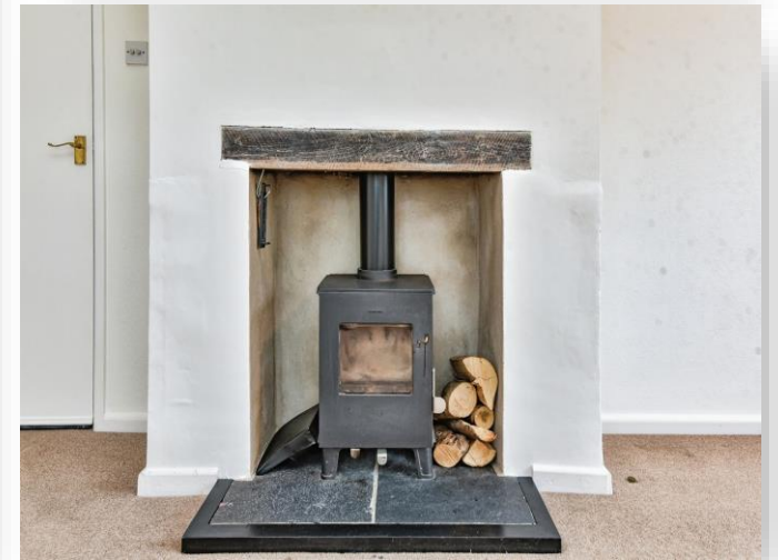
Wild Meadow Springers Hill, Coleford Radstock BA3 5LN