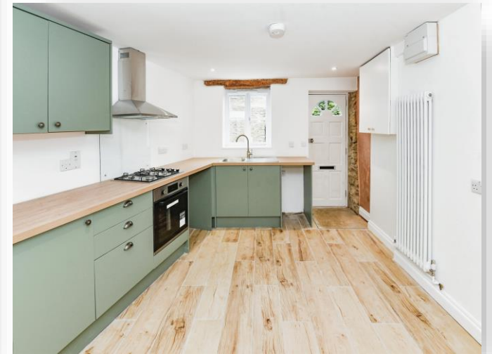
The Old Bakery Baker Street, Frome BA11 3BL