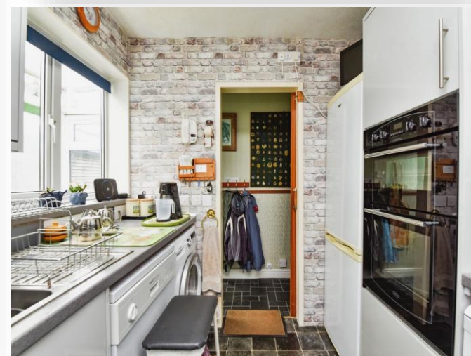
Forest Road, FROME BA11 2TQ