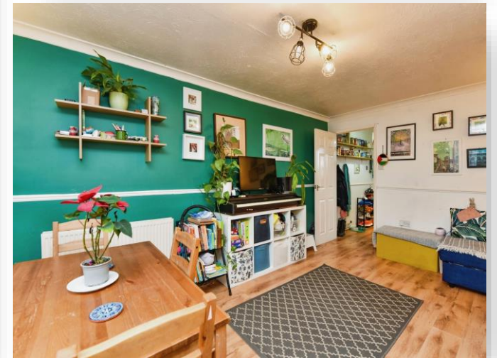
Whatcombe Terrace, Frome BA11 3SF