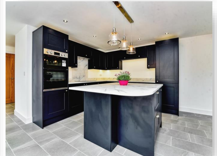
The Old Joinery Weymouth Road, Evercreech Shepton Mallet BA4 6JB