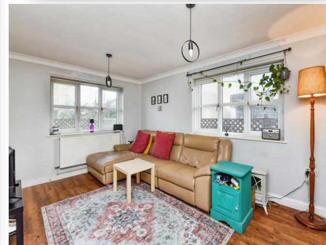
Honey Cottage Weymouth Road, Evercreech Shepton Mallet BA4 6JB