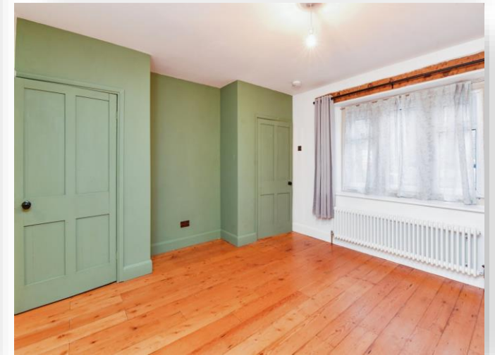
Rodden Road, Frome BA11 2AD