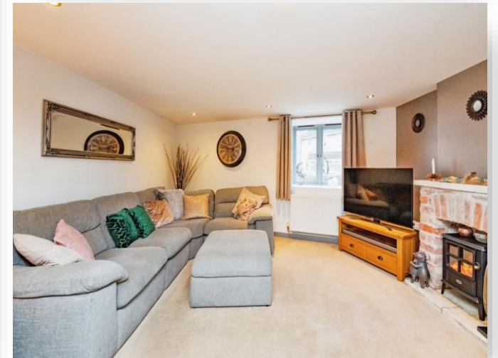
The Store Oxford Street, Evercreech Shepton Mallet BA4 6HT