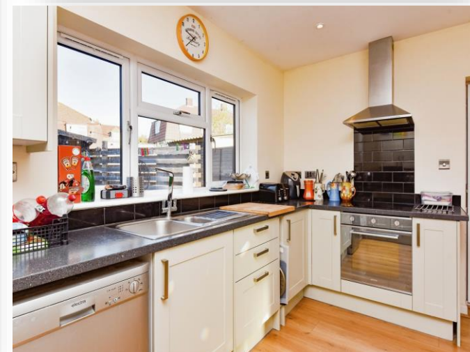
Longleat Close, Frome BA11 4AZ