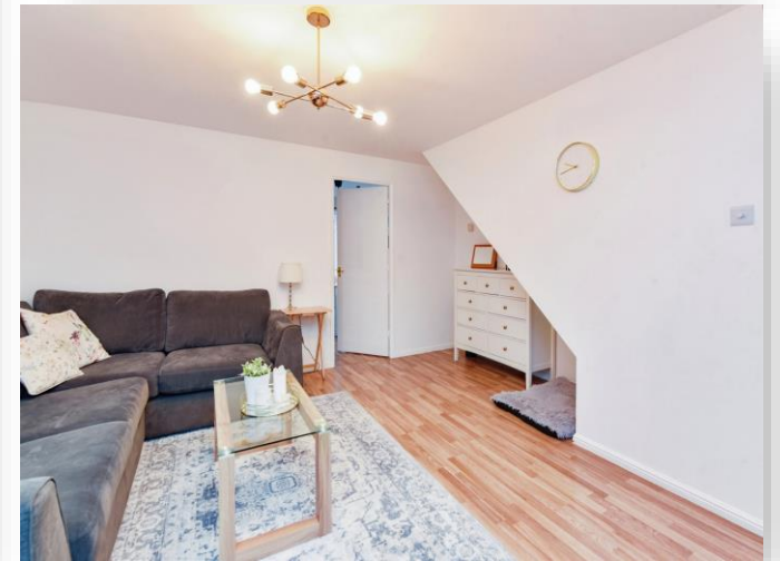
Cabell Court, Frome BA11 4BX