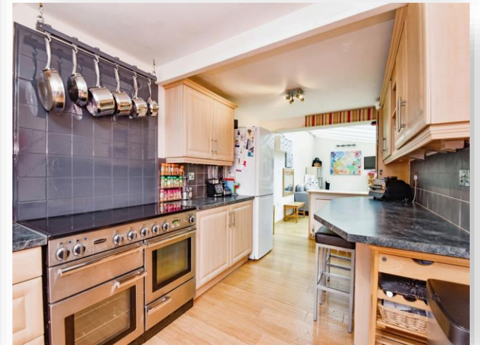
Ashfield Close, Trudoxhill Frome BA11 5DQ