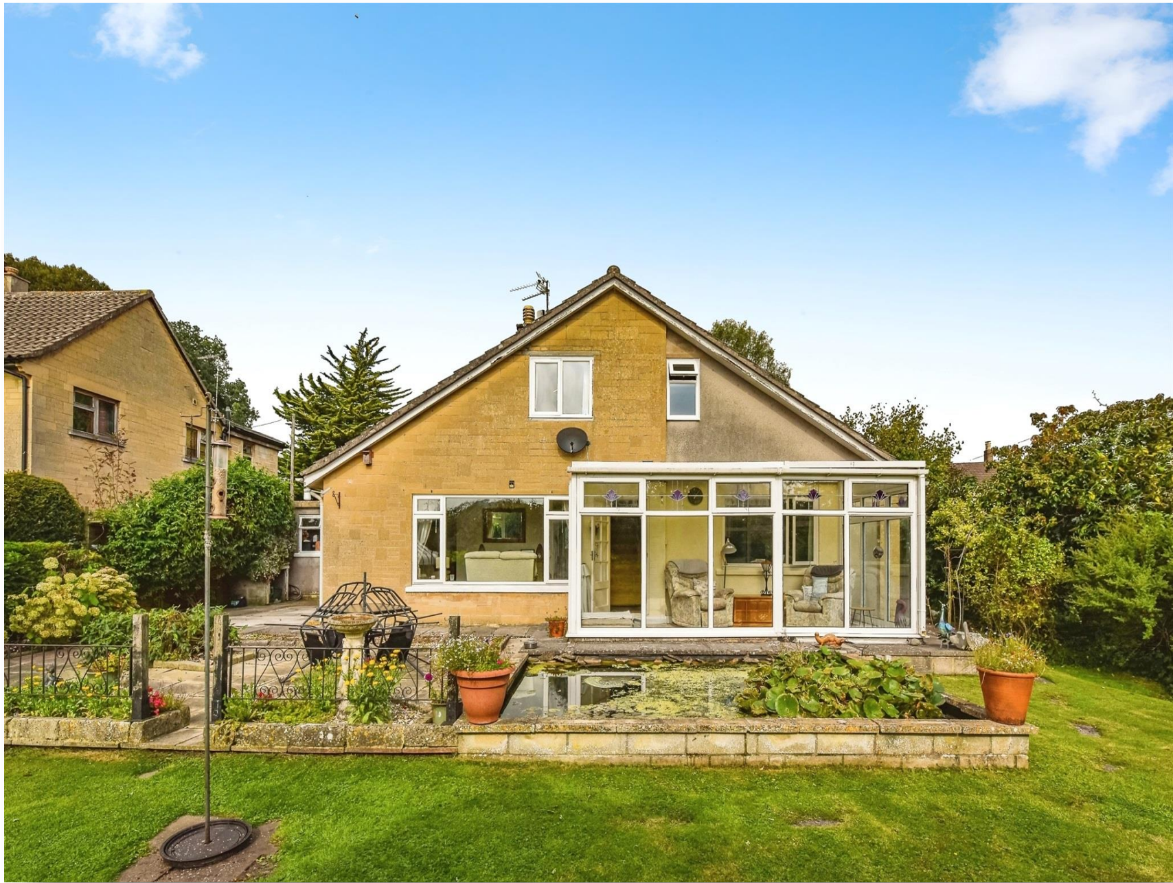
Garth, Great Elm Frome BA11 3NY