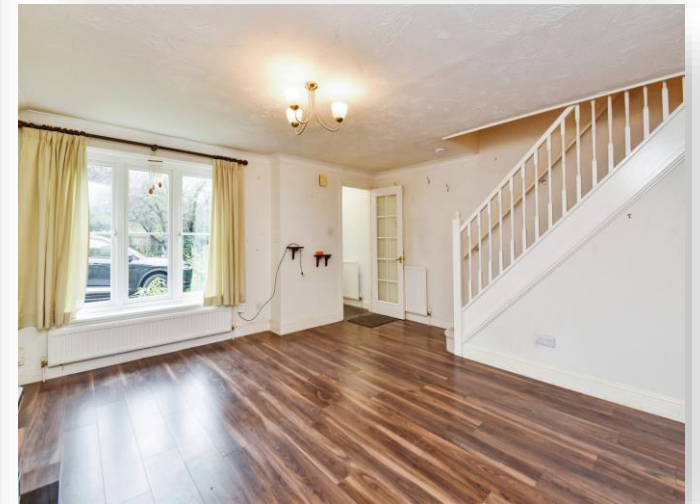
Stephenson Drive, Frome BA11 2XD