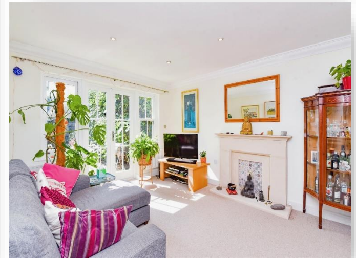
The Old Brewery, Rode Frome BA11 6NU