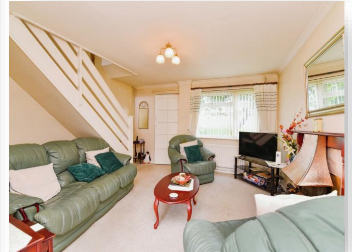
Ludlow Close, Frome BA11 2ES