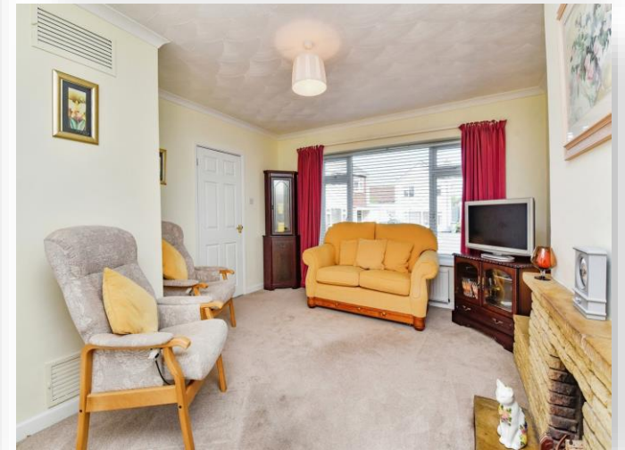
Homefield Close, Beckington Frome BA11 6SX