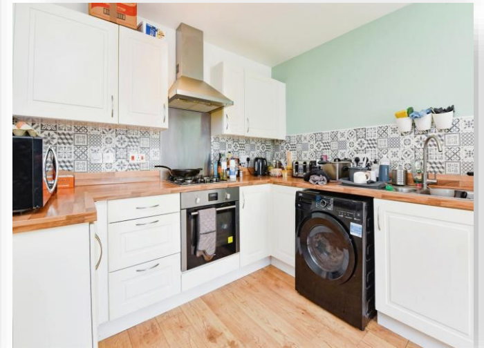
Southfield Way, Frome BA11 1FL