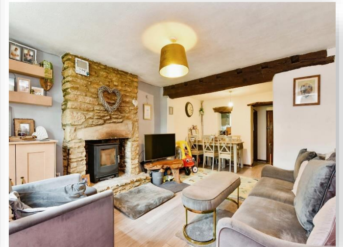
Keyford Place, Frome BA11 1JE