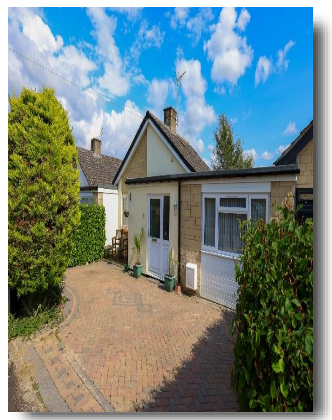
Wythburn Road, Frome BA11 2BW