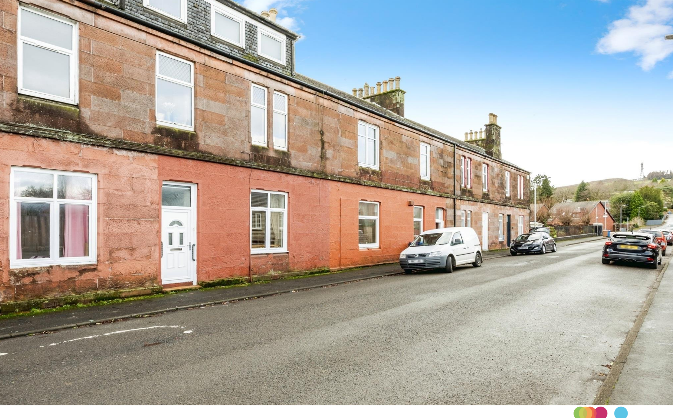
Upper Bridge Street, Alexandria G83 0AR