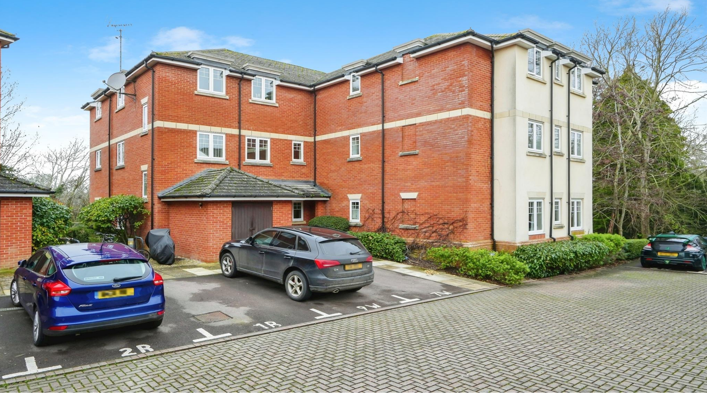
White Horse House, Wolage Drive, Grove, Wantage, OX12 9NS