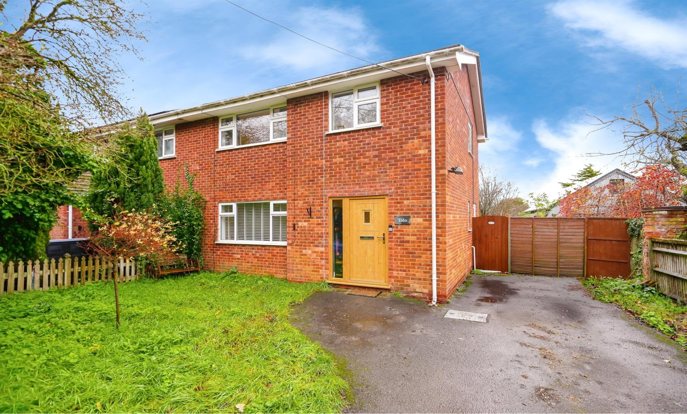
Talo, Baker Street, Aston Tirrold, Didcot, OX11 9DD